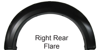
Right Rear Flare