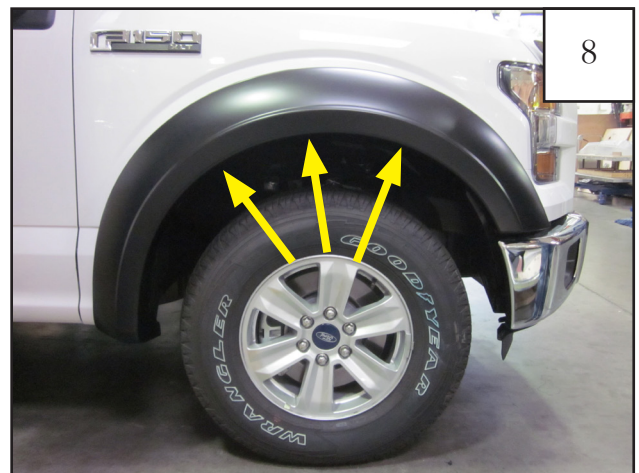
Position flare on fender, pressing inward on the flare, line up the flare mounting holes with the mounting clips on the inner piece. Install 3 Phillips Truss Screws (SW1-0058) through the flare and into the clips on the inner piece. Do not tighten. (3 locations)