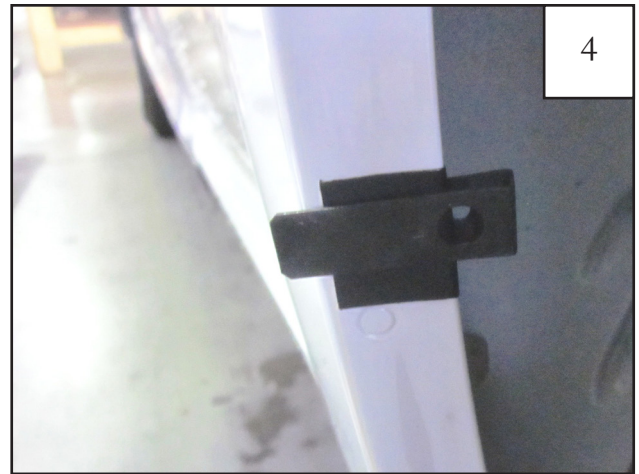
Install a Clip (CL1-0009) over the Tab (MT1-0034) placed in Step 3.