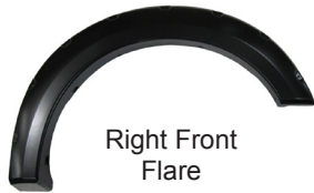
Right Front Flare