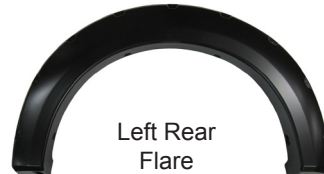
Left Rear Flare