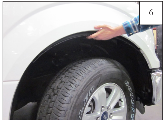
Line up the holes in the inner piece with the three uppermost factory holes. NOTE: Driver's side inner piece is marked with an "LF" and passenger's side inner piece is marked with an "RF".