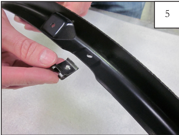
Verify presense of U-Clips on inner brackets.