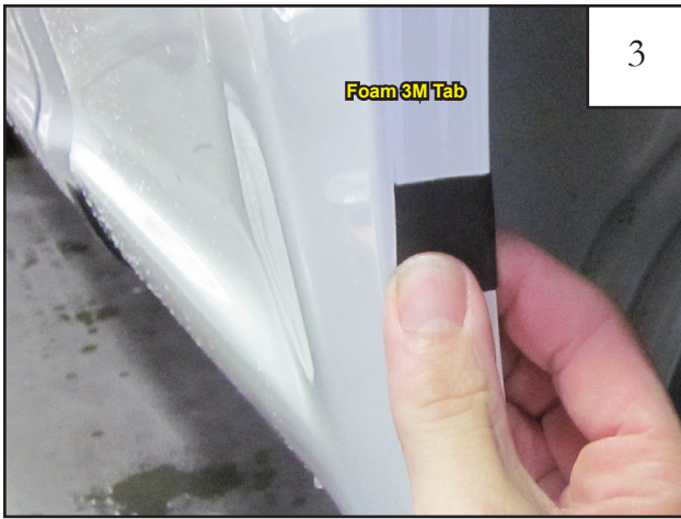
Wrap a Foam Tab (MT1-0034) around the wheel well sheet metal, centered over the mark made in Step 2.