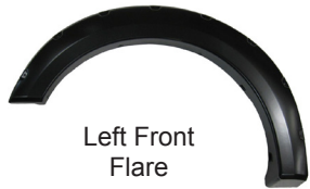
Left Front Flare